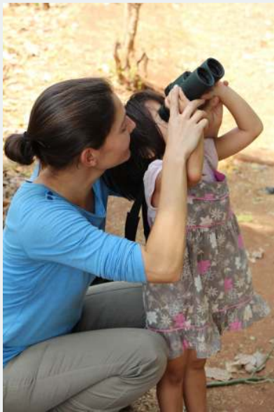
Starting young: looking for monkeys.

monkeys, their life-history characteristics relative to reproduction, reproductive hormones and mating. Using female reproductive hormones to determine female reproductive state will allow me to look at female counter-strategies to male infanticide, and the ways female mating patterns shift relative to male group-membership and