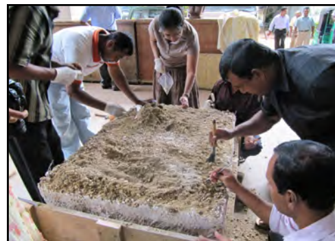
Figure 5: Working at the field site in Sri Lanka this summer.