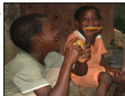
Figure 3: Children at the field site in the Dominican Republic.

In July 2009, C. Kate Curtis worked with Haitian refugees in a barrio on the outskirts of Santo Domingo, Dominican Republic to collect data for her master's thesis (see Fig 3). Her thesis is designed to determine whether or not the stable isotope analysis of hair provides an accurate measure of protein intake. Data were collected for children and included a one-month food frequency interview, hair samples, anthropometrics, and photographs of teeth to assess the frequency of growth interruptions. Kate is now in the process of analyzing her data.