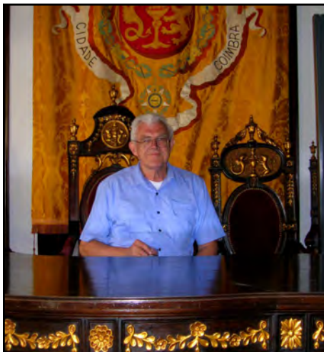
Figure 4: While at a reception held at Coimbra City Hall I decided to try out the mayor's chair and someone took this picture. The mayor wasn't there at the time.

May there always be skeletons in your closet!